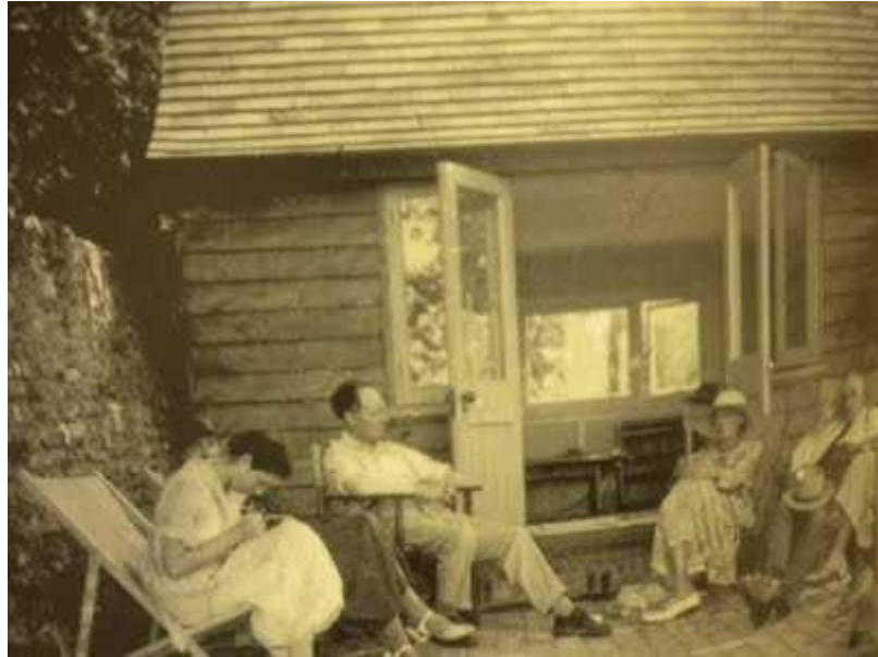
Figure 1. Monks House, home of Virginia Woolf. It shows Virginia with art critic Clive Bell, husband of Vanessa Bell, Virginia's sister, and Vanessa's daughter Angelica from her relationship with artist Duncan Grant.