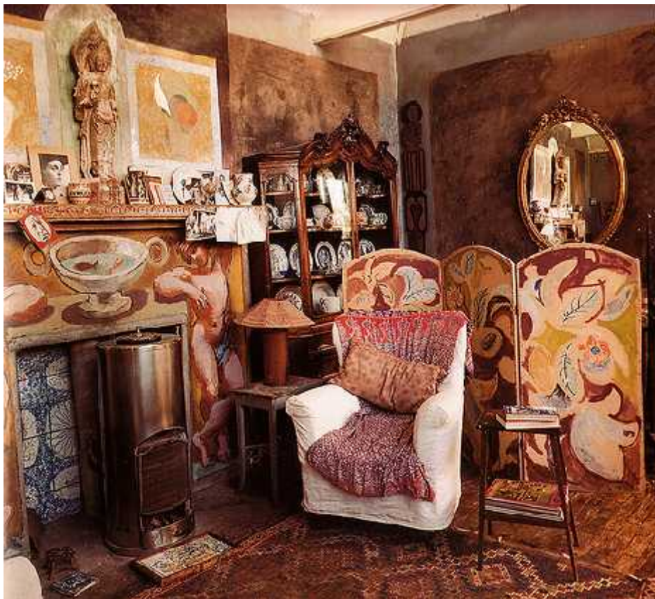
Figure 2. Charleston, the home and country meeting place of the Bloomsbury Group